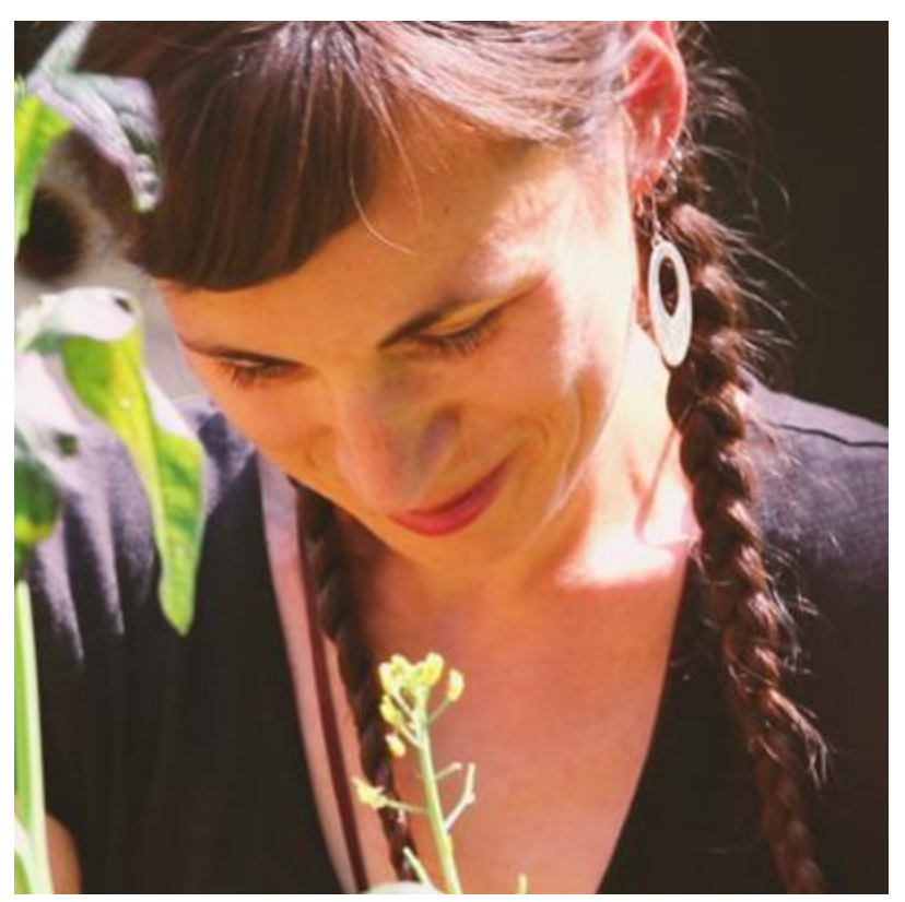
thank you all kierachristiansentoEveryone 07:13 PM