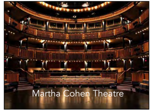
Martha Cohen Theatre