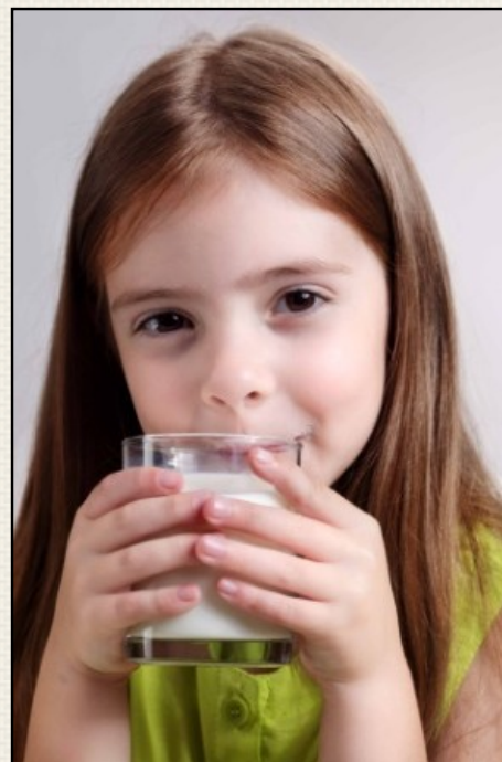
Children should have two cups (500mL) of milk per day.

For more information about healthy drinks, please visit